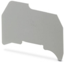
Separating plate, width: 0.8 mm, color: gray

Please be informed that the data shown in this PDF Document is generated from our Online Catalog. Please find the complete data in the user's documentation. Our General Terms of Use for Downloads are valid ( http://phoenixcontact.com/download )